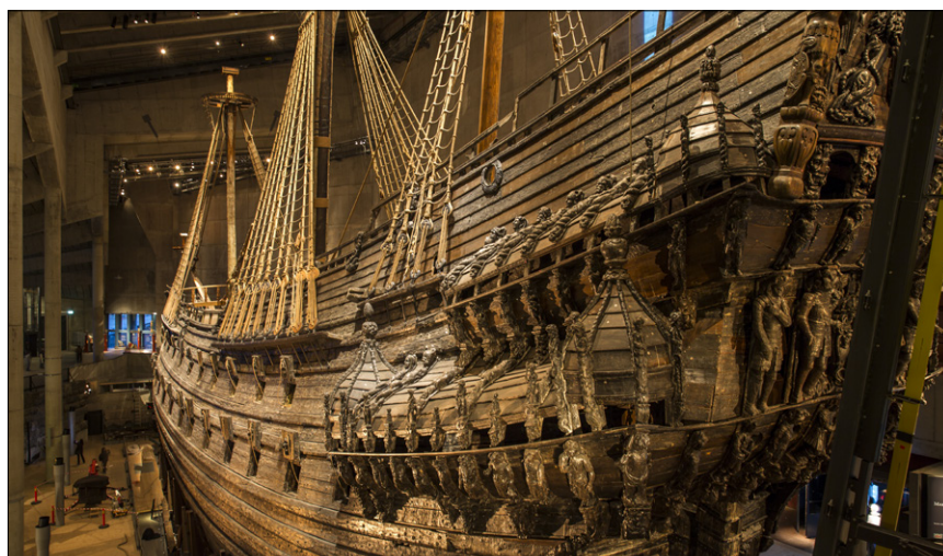
Figure 1. The Swedish warship Vasa lost in 1628, salvaged in 1961.

Waterlogged archaeological wood is often found relatively well-preserved in reduced aquatic environments, or embedded in sediments or in bogs. In particular, the Baltic Sea is well-known for the many shipwrecks preserved in its low salinity water, which prevents invasion by the infamous Teredo navalis (shipworm). 3 However, the conservation procedures of these magnificent finds from the seabed usually consume a lot of resources in terms of time, money and commitment. Moreover, the long-term preservation of waterlogged wood and especially that from shipwrecks can turn out to be even more challenging, especially when facing the formation of acidic sulfate salts on the wood surface (see,