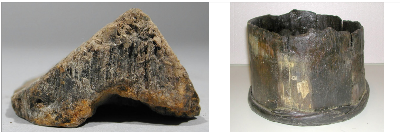
Figure 2. Sulfuric acid and sulfate salt precipitates on the wood surfaces of objects from the Swedish warship Vasa . This is mainly the result of oxidising iron sulfides (pyrite; \text{FeS}_2 ) originally formed in the archaeological wood at the seabed.

ervation of the conserved wood. 6,7 In anaerobic environments, erosion bacteria act as the primary wood degraders and consume cellulose in the wood cell walls. Associated with the erosion bacteria activity are the scavenging sulfate reducing bacteria. In a low-oxygen environment the sulfate reducing bacteria use seawater sulfate as an electron acceptor when degrading the organic debris, and as a result hydrogen sulfide ( \text{HS}^- ) is formed. In the presence of iron ions from the seawater or from corroding iron objects at the wreck site, iron sulfides such as pyrite ( \text{FeS}_2 ) are formed in the wood matrix. In a secondary scenario, in the absence of iron ions, organosulfur such as thiols ( \text{R-SH} ) are formed in lignin-rich areas of the wood. 6 If the excavated wood is placed in an environment with high and unstable relative humidity, the iron sulfides are easily oxidised to sulfuric acid at the wood surfaces of the drying wood. This development can be followed with the increasing number of acidic sulfate salt precipitates. 3,8 The iron ions may themselves catalyse oxidation and decomposition of cellulose and hemicellulose in the wood, and may endanger the long-term stability of the wooden object. There are also indications that the iron ions may have a degradation effect on the conservation agent polyethylene glycol. 9