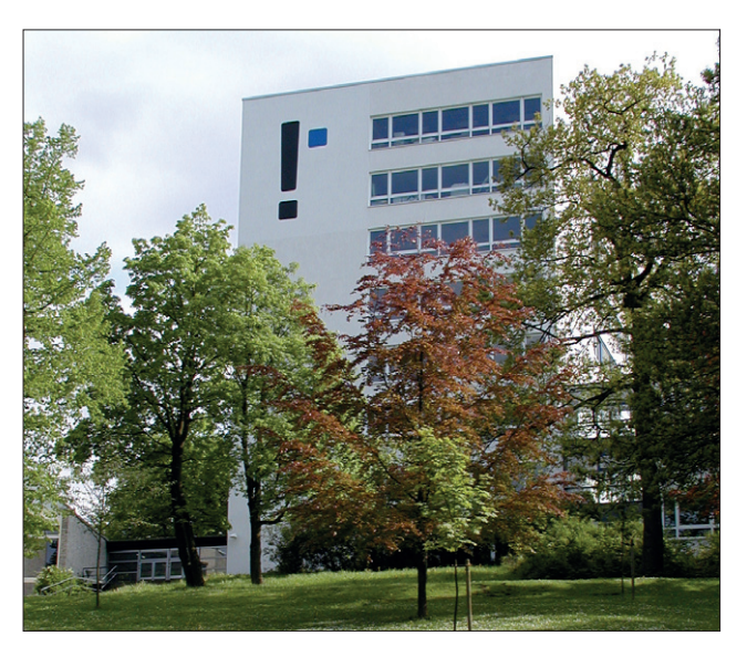
The main building of the Fachhochschule Südwestfalen in Iserlohn, Germany

I have personally been able to profit greatly from Michael Heise's unique