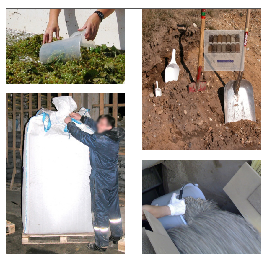
Figure 2. Heterogeneity will always interact with sampling, and will determine the degree of TOS-compliant work needed to counteract its negative effort, which gives rise to sampling errors. Primary manifestations of selected heterogeneous materials and their sampling. Top left: grab sampling (discrete sampling) of highly heterogeneous slurry (grapes/must) at a winery intake. Top right: array of optional increment sizes for sampling of soil with intermediate heterogeneity. Lower left: sampling targets, e.g. as "big bags", offer the added difficulty of the sampler not being able to observe the material and its heterogeneity (but it certainly exists nevertheless). Lower right: manual process sampling (grab sampling) of apparently uniform material. The heterogeneity manifestations shown cover the range from high to low, from visible to hidden, from the considered to the neglected.