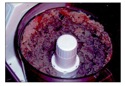
Figure 4. Significant compositional heterogeneity at the end state of "thorough mixing" of a batch of herring filets in the mixer shown in Figure 3. Invisible compositional differences among individual unit fragments are emphasised by high-powered illumination and a UV camera-filter, revealing an appreciable "hidden" residual heterogeneity in what is normally called the "homogenate". Compositional Heterogeneity (CH) is introduced in the text.

Many meso-and large-scale heterogeneity manifestations are deterministic, in that they result from specific processes, e.g. manufacturing/processing, stock laying-up processes, transport and pouring processes, flow processes. This very nearly always involves some form of dynamic activity, i.e. heterogeneous three-dimensional sampling targets are temporarily present in a moving one-dimensional configuration (flowing, ducted, conveyed, transported). Such latter sampling targets can very easily be intercepted by a cross-cutting sampling tool. This type of Distributional Heterogeneity (DH) characterises the scale interregnum between increments and the whole