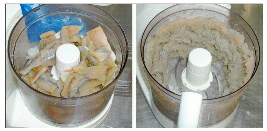
Figure 3. Example of primary manifestations of heterogeneous material in the laboratory, here herring filets subjected to sample processing and preparation in a mixer. The laboratory technician may believe that the resulting "homogenate" (right) is sufficiently well comminuted and mixed to allow direct aliquoting with a spatula (grab sampling), extracting only the precise, very small amount needed for analysis. The "homogeneity" is routinely assessed by visual inspection only. This is a major fallacy, however, as shown in Figure 4.

lated into the typical type of material(s) of interest of the reader.