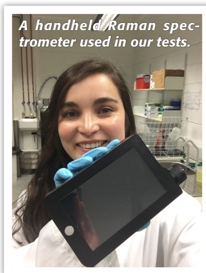
A handheld Raman spectrometer used in our tests.

Moreover, there are unique challenges to face when using biological samples.