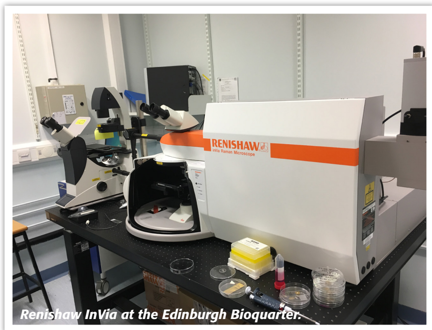
Renishaw InVia at the Edinburgh Bioquarter.

After the meeting, I spend the afternoon working on a conference presentation from the Campbell office at the School of Chemistry. Every few months,