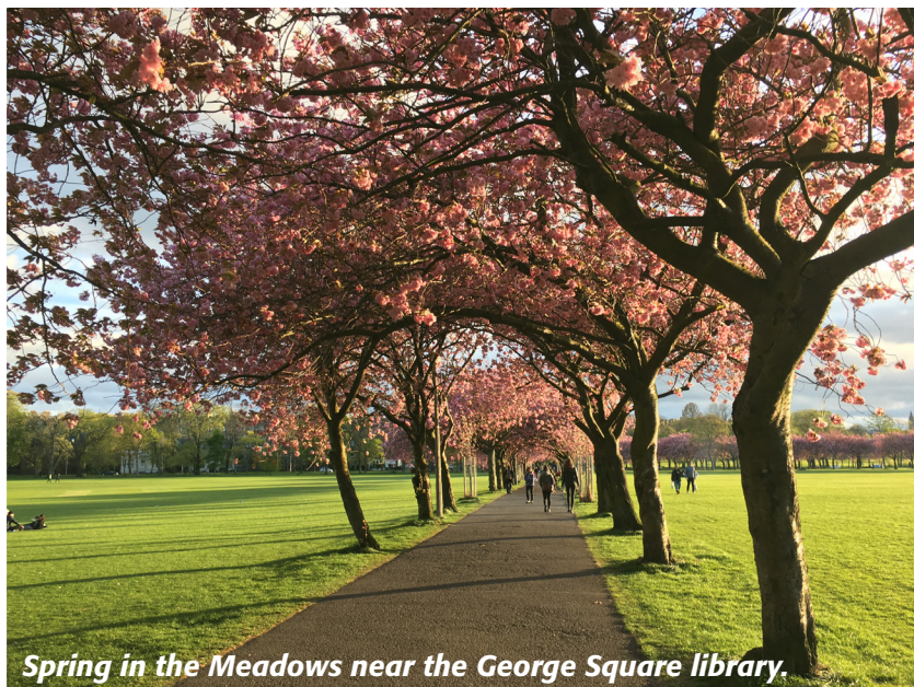
Spring in the Meadows near the George Square library.

researchers at Strathclyde, but functioning the nanoparticles with redox-sensitive molecules. As the redox state of the environment changes, so do the Raman spectra of the molecules attached to the metal nanoparticles. Therefore, the Raman spectra can be used as a readout for the redox state within 3D cell cultures or even tumour models. 3