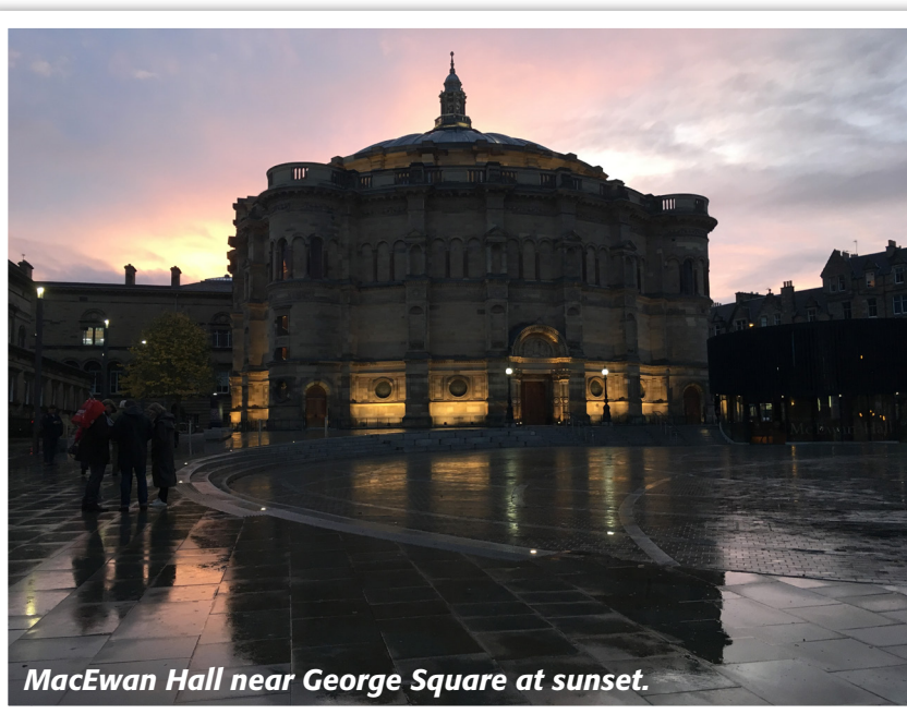
MacEwan Hall near George Square at sunset.